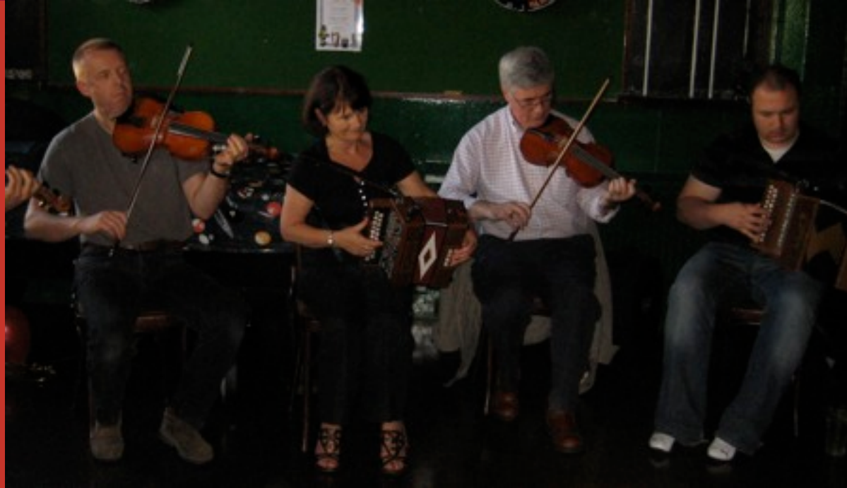
Cambridge Musicians at the celebration session in the Rathmore club

Funded Through the Irish Government Emigrant Support Programme